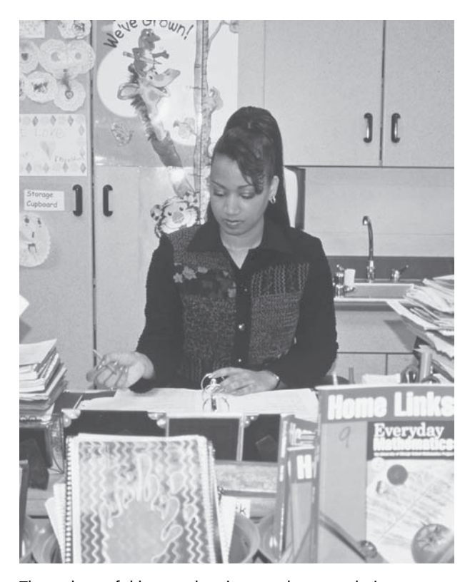
Through careful lesson planning, teachers can design strategies that have an increased probability of gaining students' interests and preventing discipline problems.

When teaching is defined, teachers have a clearer perception of what behaviors